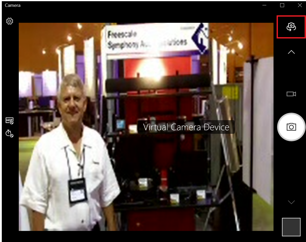
Figure 2: Windows camera test tool

2. Open the camera tool Windows provides, switch to use the target camera by clicking the button in the red circle.