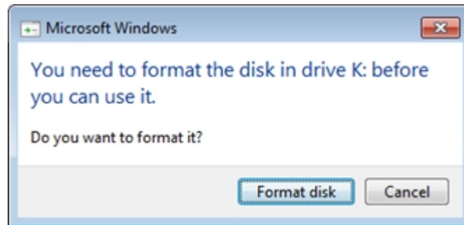
Figure 1: Format the disk

When the format is completed, the computer will display the capacity of 4k removable disk.