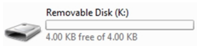
Figure 2: RAM u-disk

When the format is completed, the computer will display the capacity of 4k removable disk.